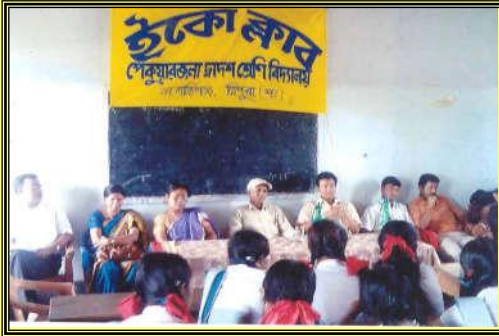
Seminar organised by Eco Clubs