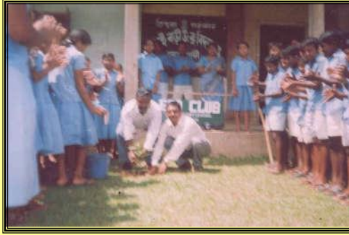
Plantation Programme By NGC