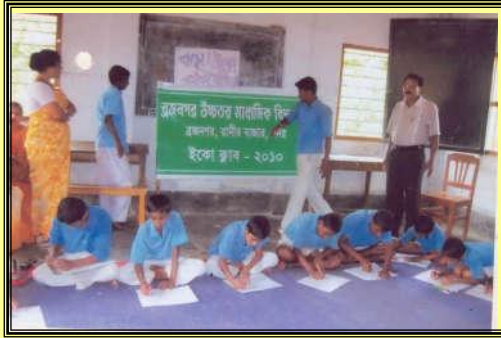
Sit & Draw Competition By NGC