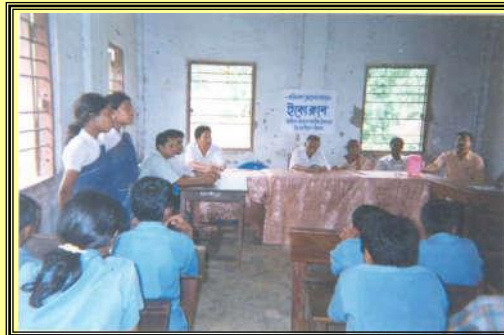
Seminar organised by NGC students