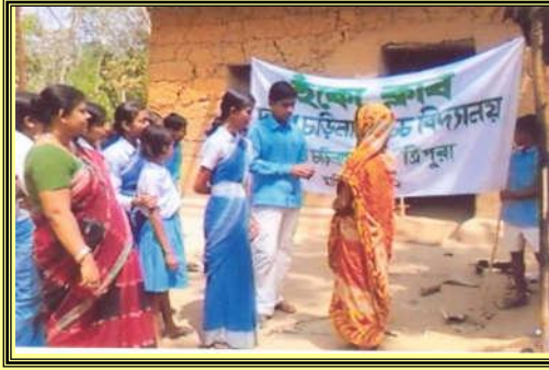
Door To Door Campaign By NGC with Teacher