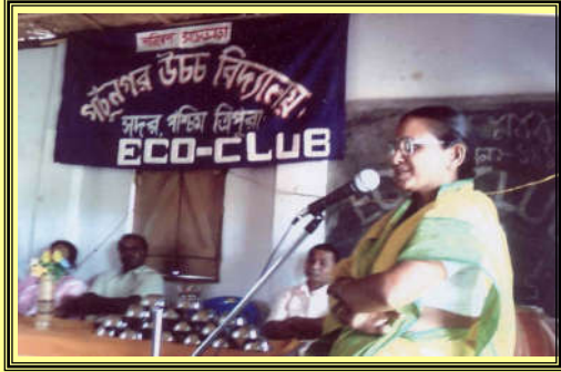
Seminar Organised by Eco Club