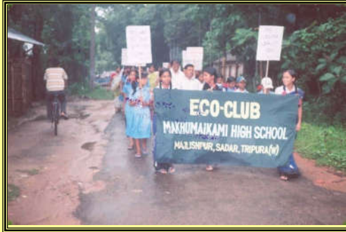
Rally by Eco Clubs