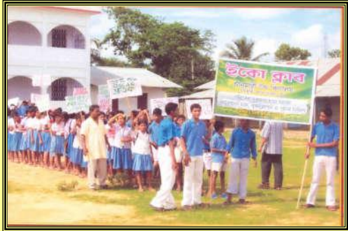
Rally by Eco Clubs