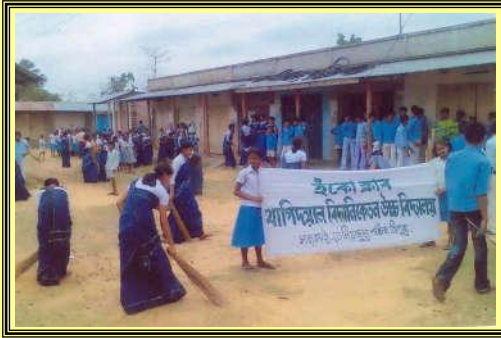
Safai Abhijan By NGC