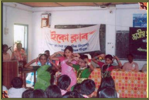
Cultural Programme by NGC